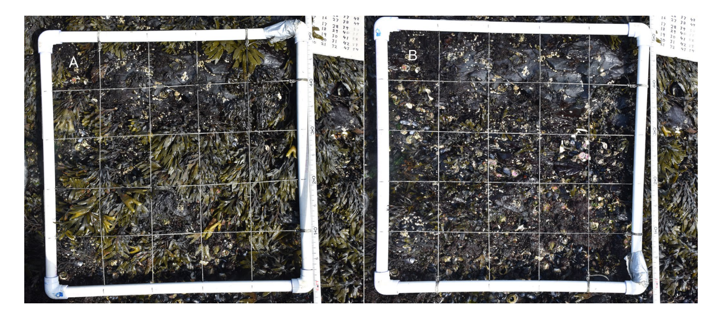
FIGURE 2 A. View of a 0.25-m<sup>2</sup> quadrat before removing the algae. The cords are 10 cm apart. The transect tape is on the right and the orienting tile, which is always placed in the center of the square meter, is visible in the top-right corner, indicating that this photograph is of the bottom-left (southwest) quadrant of the full quadrat. B. View of the same quadrat after removing the algae in order to count barnacles and invertebrates. Original photographs were of high resolution so that students could zoom in to inspect the quadrat closely